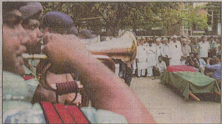
Coffin of Abdus Samad Azad draped in the national flag lies in state at Banani graveyard as policemen play the last post to honour the veteran politician yesterday.