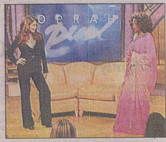
Ashwariya (L) teaches Oprah how to look graceful in a sari

Ash: No, Indian people are very hospitable.