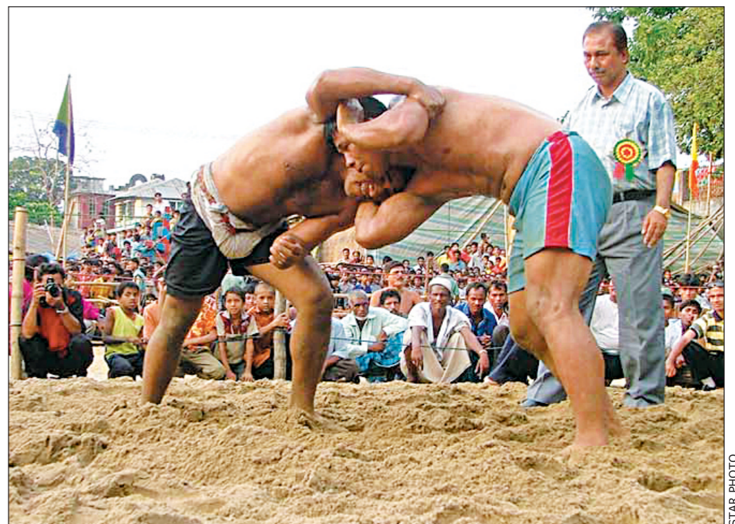
The Baishakhi Mela (fair), left, was held on the occasion of the Jobbarer Boli Khela while two wrestlers, above, battle for retaining championship.