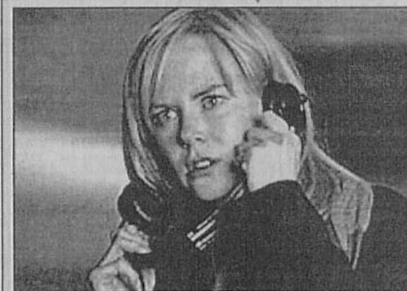
Kidman plays a UN employee whose life is endangered

Political thriller The Interpreter has topped the North American box office on its opening weekend. The film, directed by Sydney Pollack and starring Nicole Kidman, drew $22.8m (£11.9m) in ticket sales.