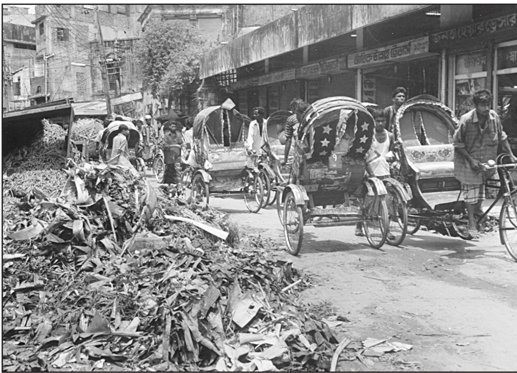
B K Das Road in the old city is left with a heap of waste only a day after the completion of the special cleanliness drive of the Dhaka City Corporation. The picture was taken yesterday.