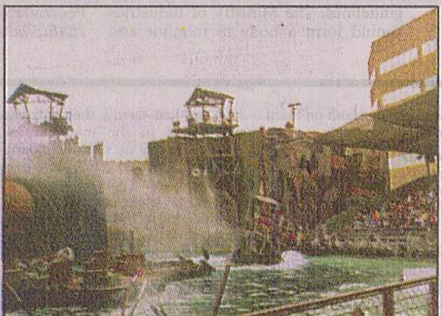
The set of Water World

Universal Studio at Hollywood -- the only movie thrill park