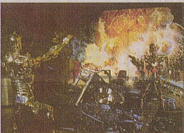
Action at the set of Terminator 2

in the world, needs no introduction. It's a world of modern and futuristic wonders, as well as replicas of ancient marvels. At the Studio you can hear the cameras rolling, get an inside look at the sets and uncover the behind-the-scenes secrets of legendary films. Special Effects Stages let you jump into the action of creating the special effects of movie's most amazing illusions.