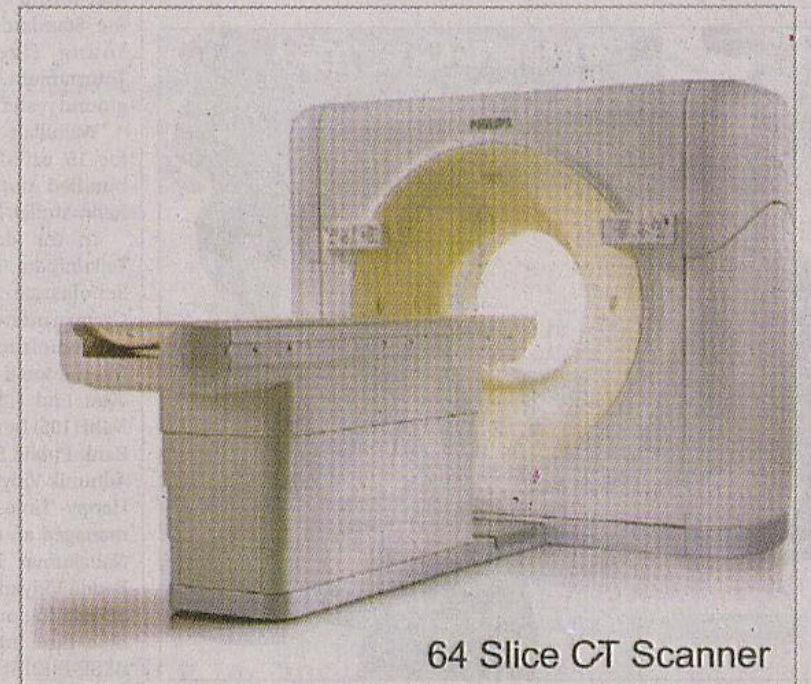
64 Slice CT Scanner

Apollo Hospitals Dhaka, Plot 81, Block E, Bashundhara R/A, Dhaka-1229