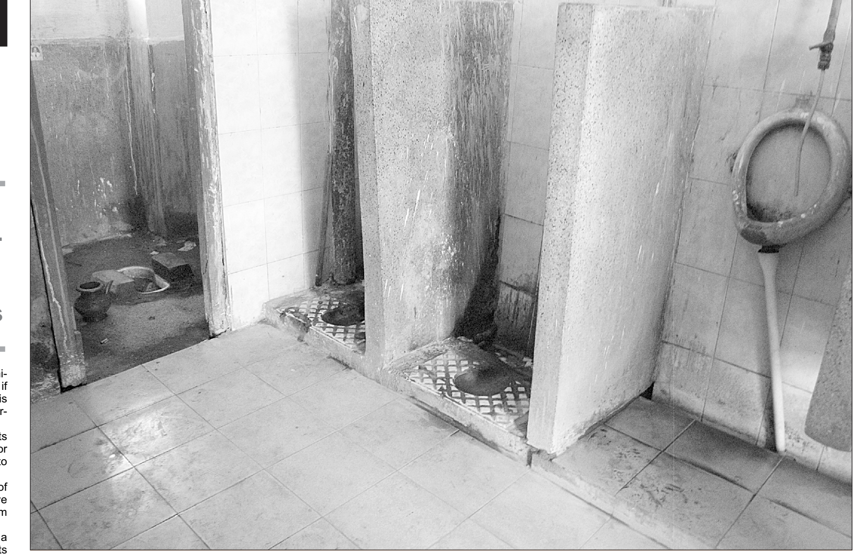
SORRY STATE OF AFFAIRS: Dhaka University toilets are in bad shape as their dilapidated conditions and bad odour make them unuseable.

Sources said the university has a very small budget for cleaning the Arts Building.