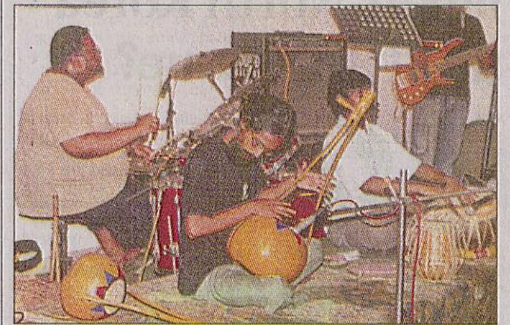
Purbo-Poshchim performing at the band music session

Purbo-Poshchim has performed in Osmani Memorial Hall, the National Museum, the Fine Arts Institute, DU, the Indian Cultural Centre and Goethe Institut.