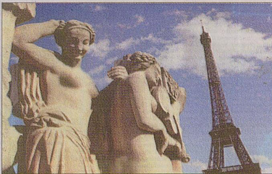
Eiffel Tower from different angles

Dwelling on his motivation for a focus on the