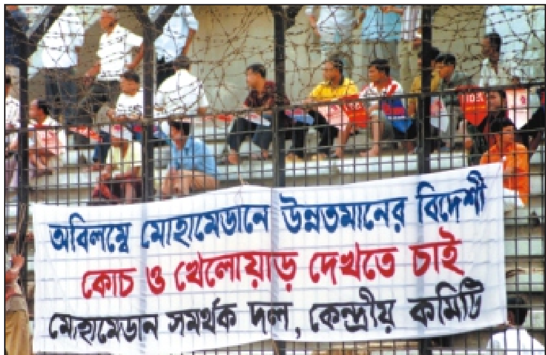
THE PICTURE SAYS IT ALL: Frustrated Mohammedan supporters put up a poster demanding a quality foreign football coach and players during yesterday's Federation Cup match.

Ponting's bat was up for review. "At present there is a MCC process ongoing on this matter and,