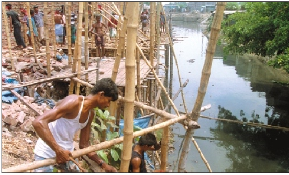
Workers of Dhaka Water and Sewerage Authority knock down illegal structures on a canal in Mugdapara as part

jects. While the government was SEE PAGE 15 COL 3