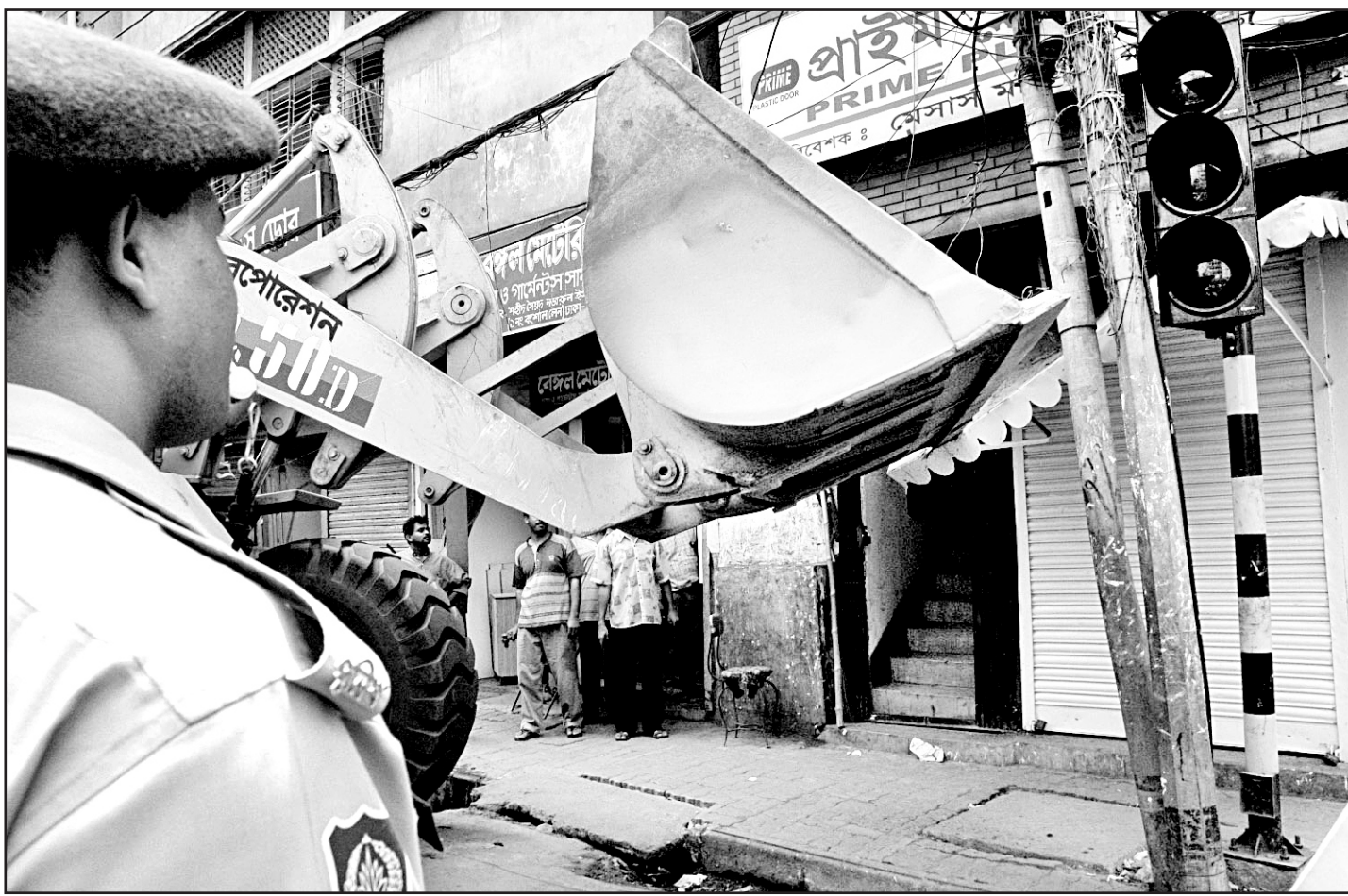
Dhaka City Corporation dismantles various structures on the footpath at North South Road yesterday.