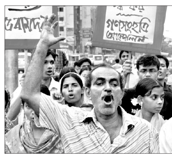
Five left-leaning parties stage a demonstration in the city yesterday protesting attacks on the Ahmadiyya community in Satkhira.

that it does not want to show respect to the poor garment workers who play a vital role in the country's