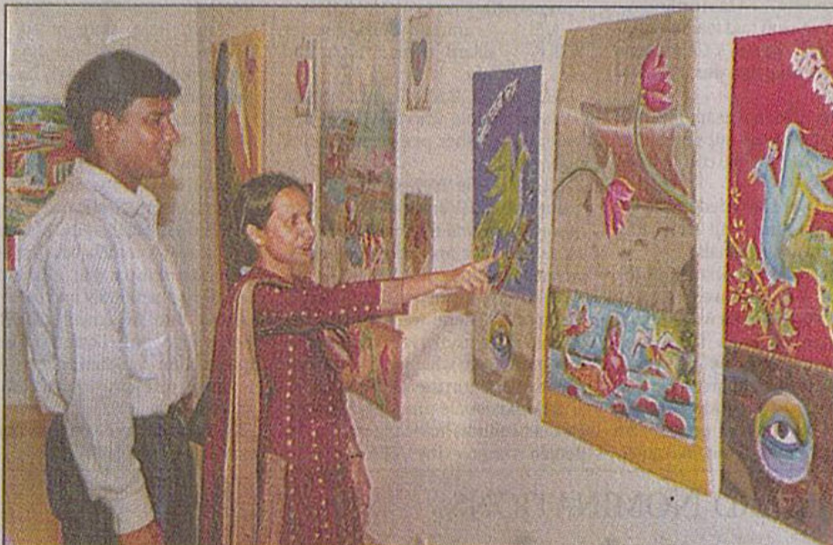
Visitors at the exhibition