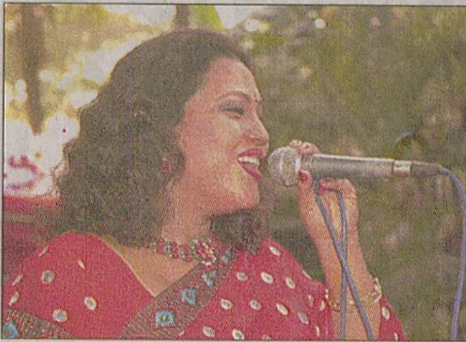
Popular singer Momtaz performing at the event