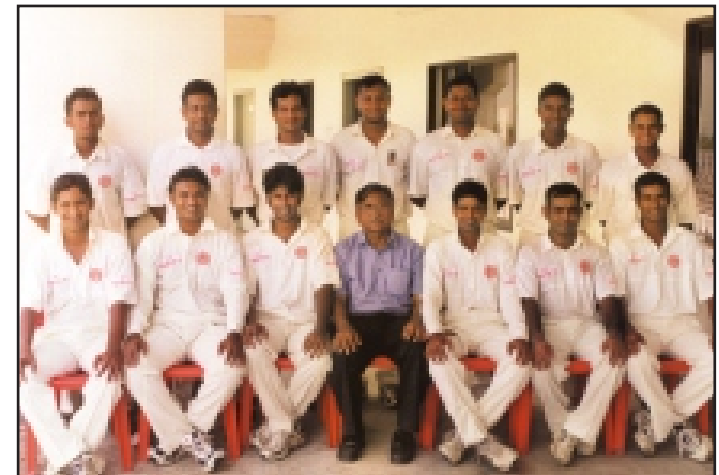
CHAMPIONS AGAIN: Members of the Dhaka cricket team who retained the National League title on Saturday.