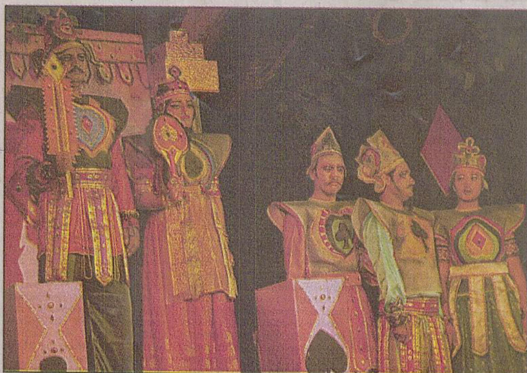
A scene from the play Tasher Desh

The storyline: A strange land where the powers that be strictly regulate every action of the people. This results in unhappiness and lack of creativity among people,