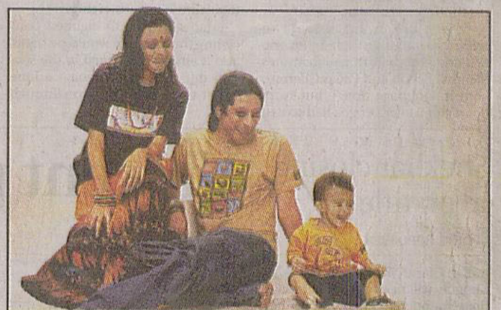
T-shirts capture various traditional patterns

Nitya Upahar's Baishakhi exhibition contains a total of 15 designs, among which six are new. Apart from these, there are two T-shirts for children: Aamar Shonar Bangla and Khara Duto Shing . The exhibition will run till April 30.