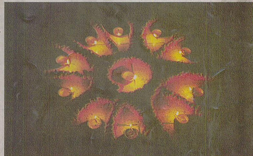
Lighting traditional clay lamps in the hope of a brighter tomorrow

The State Minister for Cultural Affairs Begum Selima Rahman will attend a special programme organised by Jatityo Granthakendra at the Central Public Library auditorium. She will present books to the publishers, literary personalities and also people from different walks of life to promote the trend of pre-