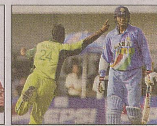
India Vs Pakistan On BTV and DD Sports at 9:30am Fourth ODI Live from Ahmedabad, India