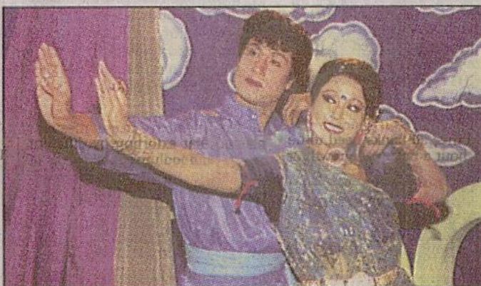
A dance sequence from Esho Hey Baishakh