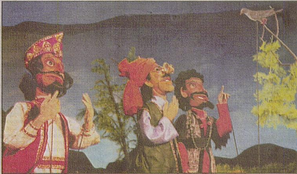
Surer Pakhi: A colourful scene from the puppet show

The first show was Kusree Hansher Chihana, an adaptation of Hans Christian Andersen's popular fairytale The Ugly Duckling. The show began with a scene of dawn