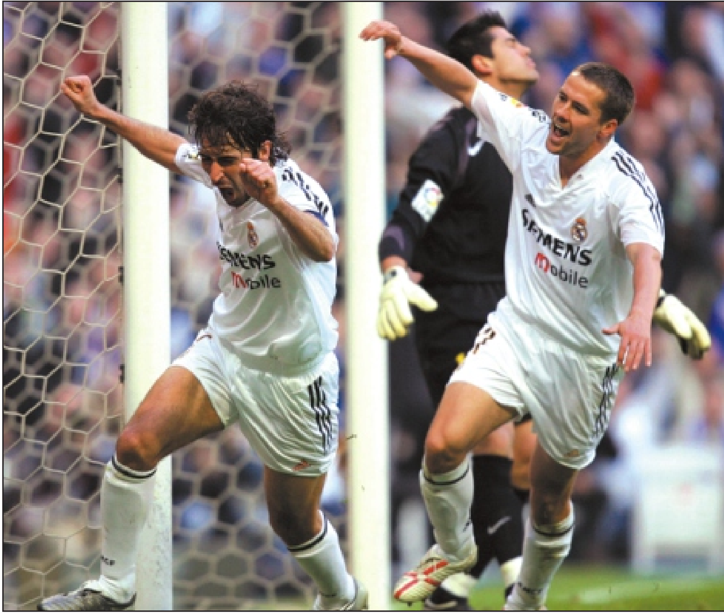
REAL RAUL ROLL: An ecstatic Real Madrid superstar Raul (L) is being chased by teammate Michael Owen after he had scored the third goal against Barcelona at Madrid on April 10.