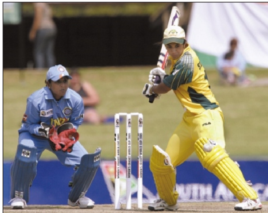
WOMEN TO THE FORE: Australian batswoman Lisa Sthalekar gears up for a cut shot during the final of the women's World Cup at Supersport Park in Pretoria, South Africa on Sunday.