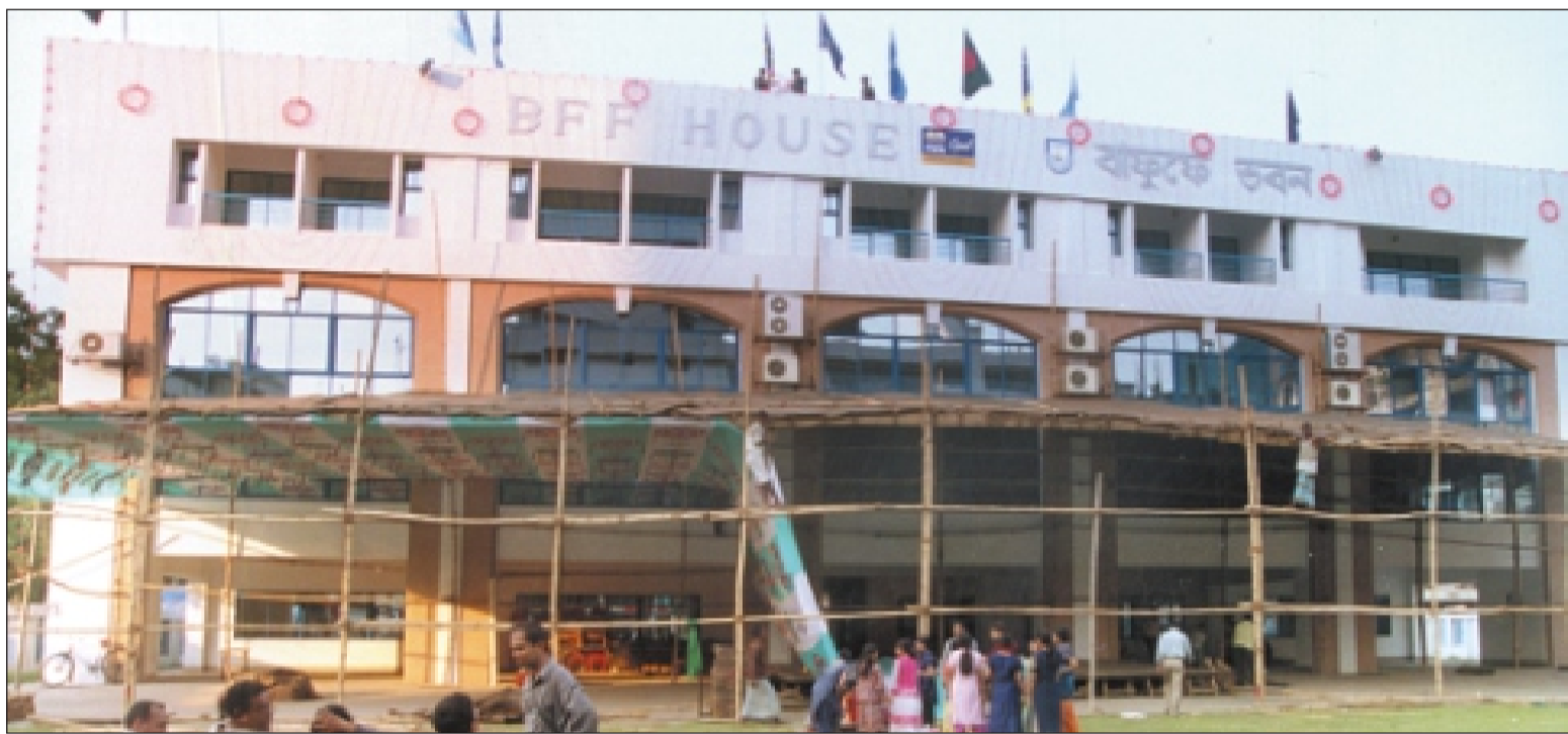
BEGINNING OF A FOOTBALL DREAM: (L) Dancers treat the audience to a display during the inauguration ceremony of the BFF House at Dhaka's Arambagh on Sunday. (R) Chief guest Asian Football Confederation President Mohammed Bin Hammam looks at posters depicting Bangladesh. (Bottom) A frontal view of the BFF House.