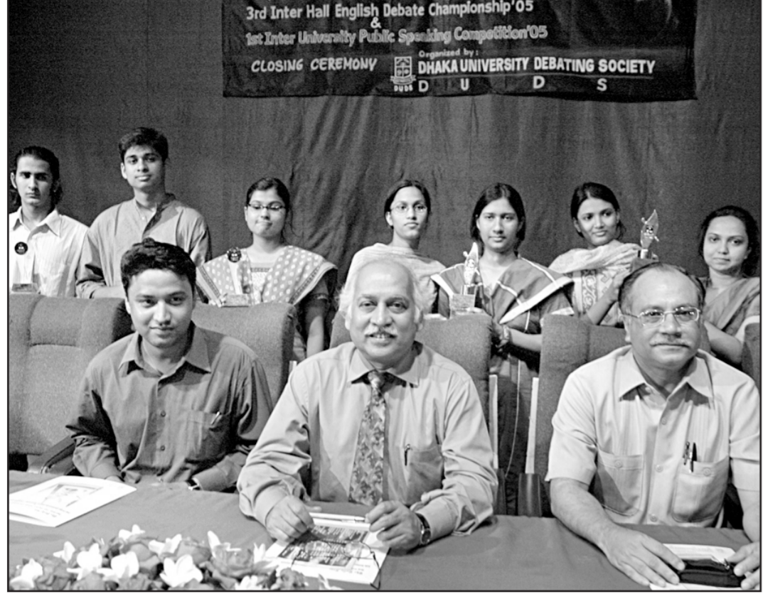
Winners of The Daily Star 3rd Inter Hall English Debate Championship-2005 and 1st Inter University Public Speaking Competition-2005 pose with the guests at the Teacher-Student Centre (TSC) auditorium yesterday.

Hundreds of students, guardians and locals staged a demonstration on the Tanore Bohroil High School premises after confining the headmaster at his office for three hours in the morning.