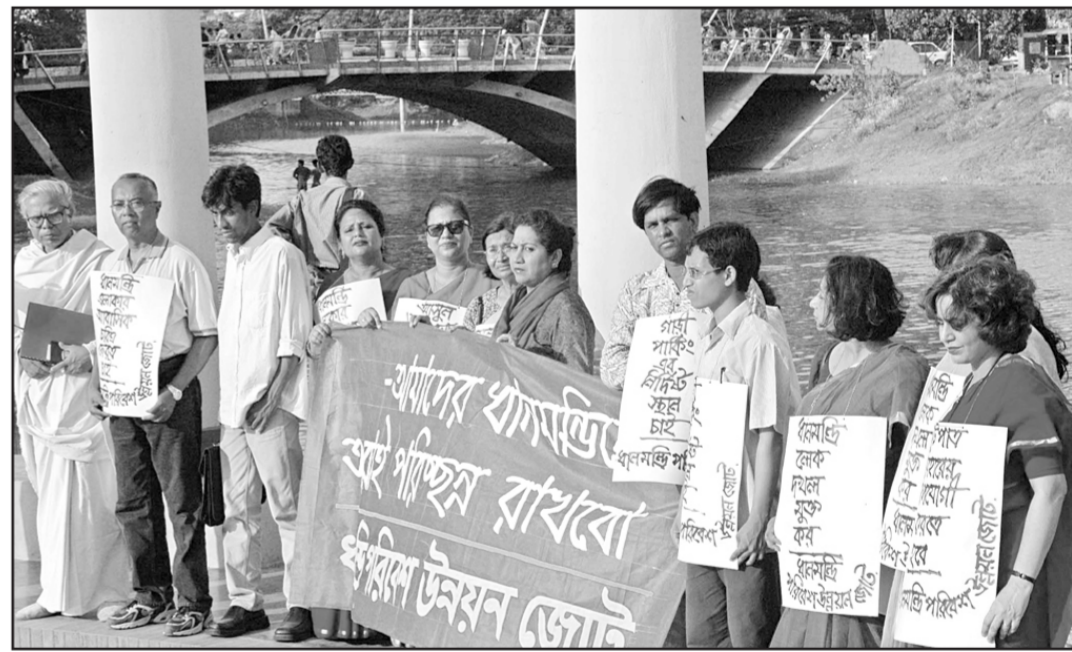
Dhanmondi Paribesh Unnayan Jote forms a human chain at Dhanmondi in the city yesterday with a slogan 'We will keep our Dhanmondi clean'.

The Women Entrepreneurs' Association (WEA) and the Mini Mart Group have organised a three-day Baishakhi Mela beginning on April 11, says a press release.