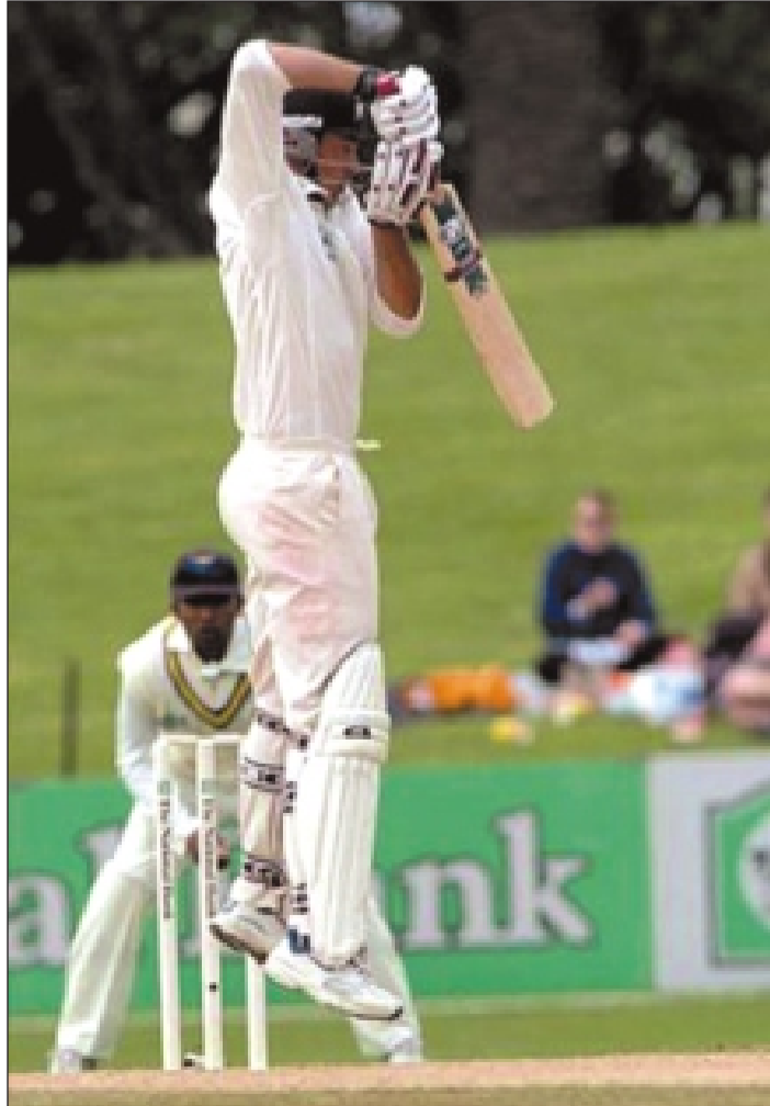
STANDING TALL: New Zealand captain Stephen Fleming defends off the back foot on the last day of the first Test against Sri Lanka at Napier yesterday.