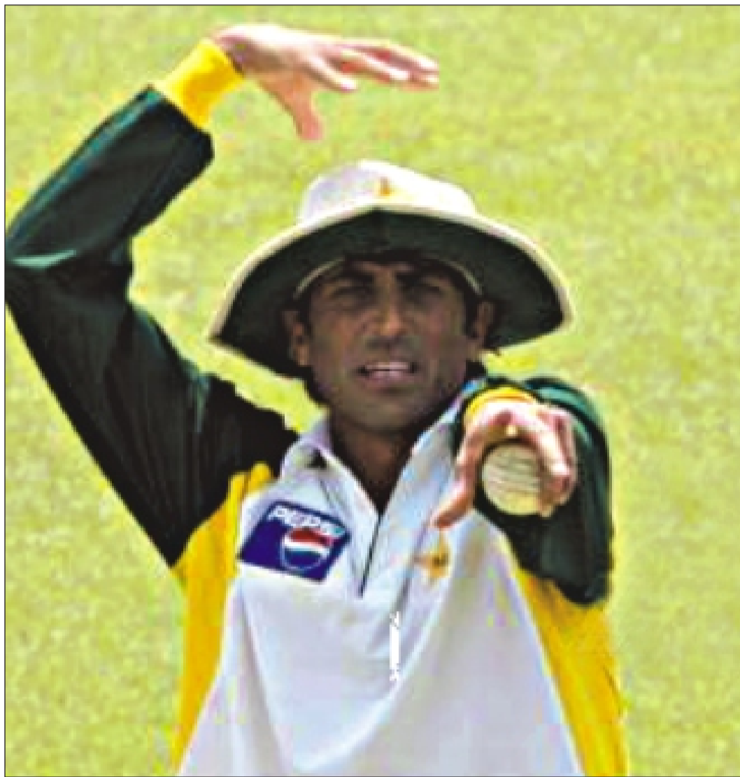
I'M BACK! Younis Khan, the in-form Pakistan batsman, gestures during a training session in Jamshedpur yesterday. Pakistan and India meet in the third ODI of their 6-match series here today.