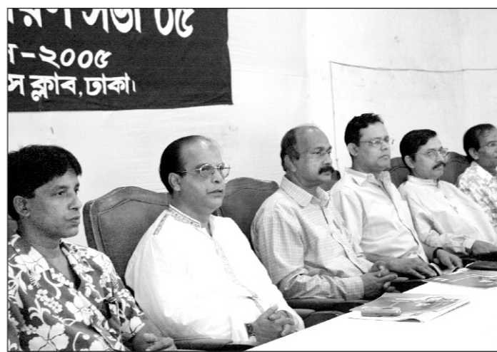
The annual general meeting of the Dhaka Union of Journalists was held at the National Press Club yesterday.