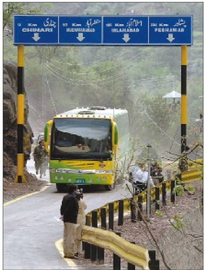
The first bus from the Pakistan-controlled Kashmir arrives with 30 passengers on their way to Indian-controlled Kashmir yesterday at the Chakothi post on the Line of Control, some 61 kilometers east of Muzaffarabad, Pakistan.

OUR CORRESPONDENT, Gaibandha At least 95 people were injured as nor'wester lashed 17 villages in three upazilas of the district early yesterday. Of the injured, 35 were admitted to Gaibandha Sadar Hospital, seven to Rangpur Medical College Hospital and the remaining 53 to upazila health complexes. The badly affected villages are Falchari, Kachipara, Udakhali and Uria under Falchari upazila and Bariyerjan, Purbo Kamornai. SEE PAGE 19 COL 3