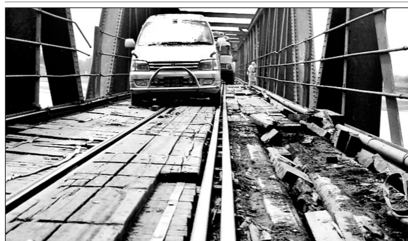
Vehicles crossing the rundown Teesta bridge amid risk of accident any moment.

It was also found that audit teams holders are crowding the post office every day to know about their