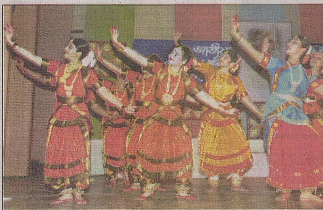
A colourful dance sequence at the event