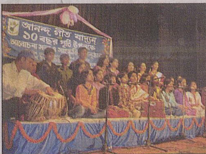
Students of Ananda Geet Badyam rendering a song