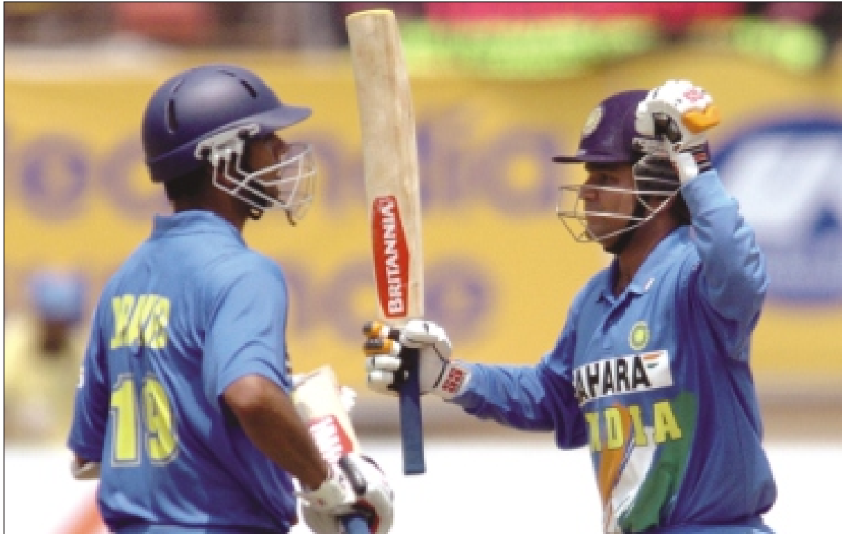
HEROIC TRIUMVIRATE: (L) India opener Virender Sehwag (R) raises his arms upon reaching his hundred as Rahul Dravid, who also scored a century, dashes towards him to congratulate during the first ODI against Pakistan at Cochin yesterday. (R) Sachin Tendulkar, who had his share of the day with five wickets, grimaces in pain after hurting his hand.