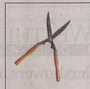
Cutting Access Fee