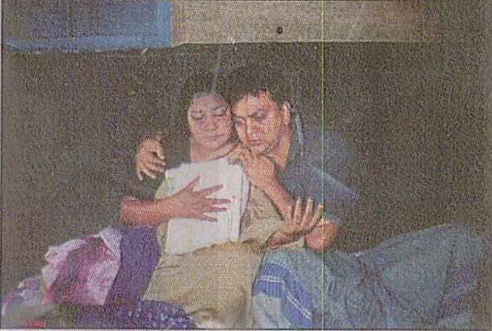
A scene from the drama serial Khanda Chitra