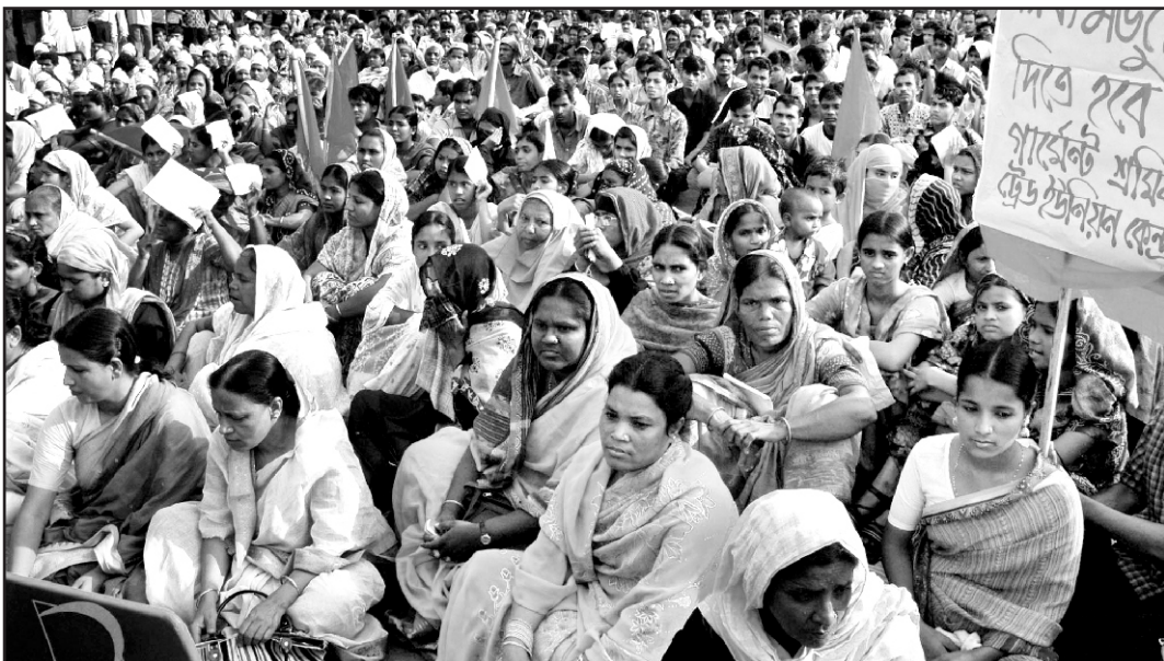
Sramik Karmochari Oikya Parishad organises a grand rally at Muktangan in the city yesterday demanding immediate implementation of its agreements with the government.

Dr Barakat presented a 21-point recommendation for the proposed 'national government'.