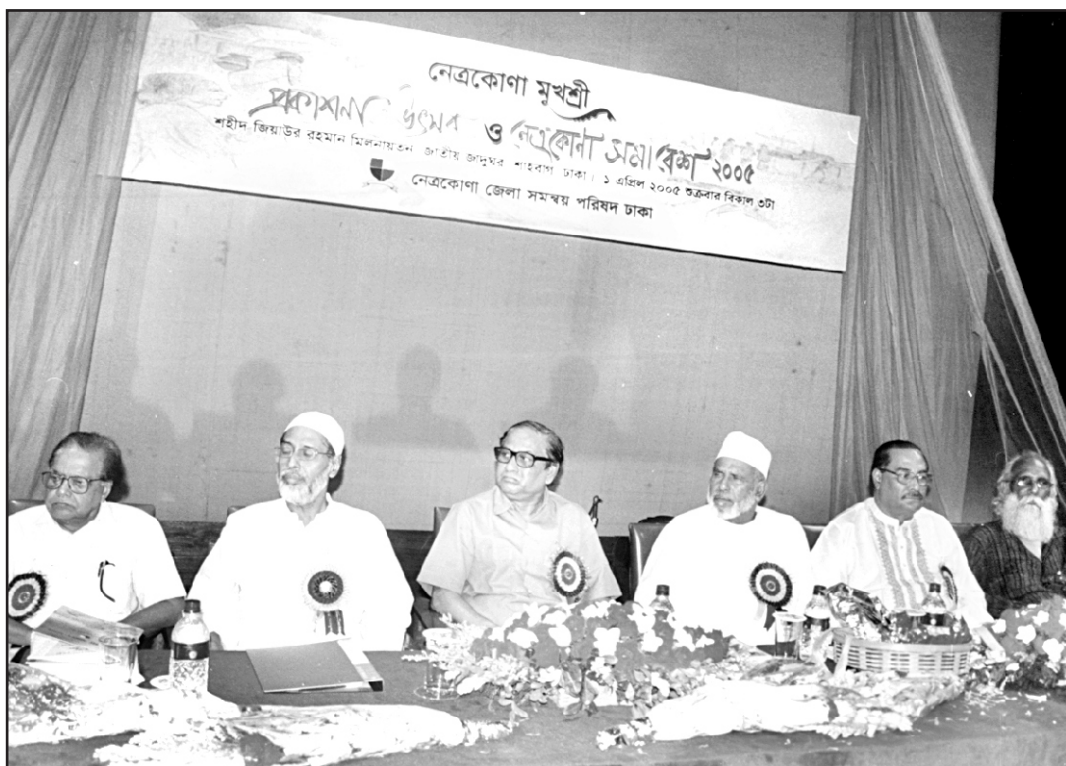
The publication ceremony of 'Netrakona Mukhosree' and a get together of the people of Netrokona was held at the National Museum auditorium in the city yesterday.

He has a long experience in school and institution management in the UK, USA, Portugal and Italy.