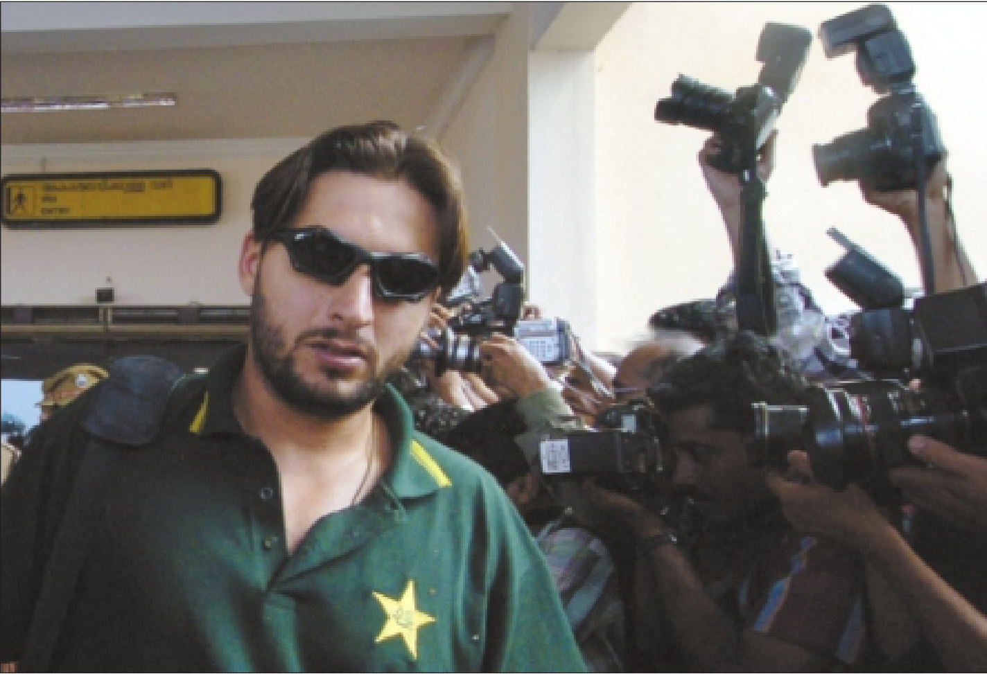
STAR AGAIN! Photographers take snaps of Pakistan all-rounder Shahed Afridi and his teammates on their arrival at Cochin International Airport yesterday. Afridi has made a memorable return to the Pakistan side after months in the wilderness.