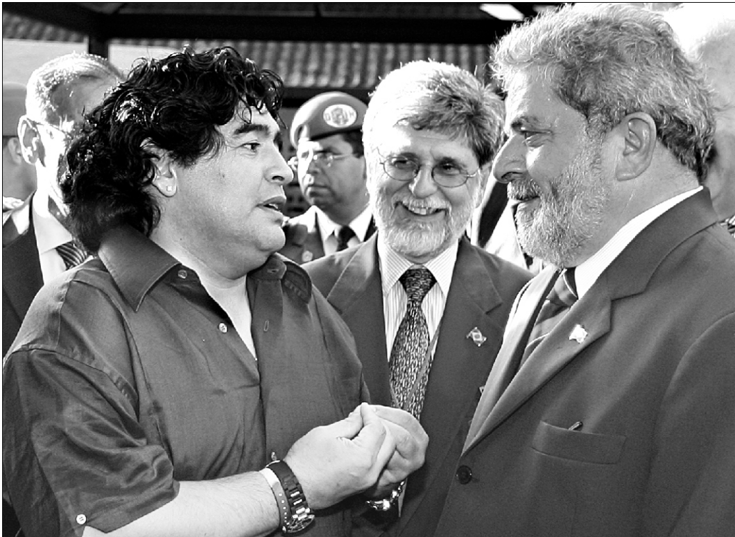
KING OF FOOTBALL MEETS PRESIDENT OF SAMBA LAND! Brazil's President Luiz Inacio Lula da Silva (R) listens to Argentine legend Diego Maradona (L) next to the Brazilian Foreign Affairs Minister Celso Amorim during a break in the heads of state (Venezuela, Colombia, Brazil, Spain) quadripartite summit in Puerto Ordaz, 550 km from Caracas, Venezuela on March 29. Maradona is in Venezuela to attend the opening of the Under-17 South American soccer championship in Maracaibo.

AFP, Munich UEFA president Lennart Johansson has backed West Germany's 1974 World Cup victor Franz Beckenbauer to succeed him when he steps down in 2006. FIFA president Sepp Blatter has already tipped Beckenbauer for the post and Swede Johansson gave his seal of approval to 'the Kaiser' on Wednesday. "Why shouldn't he replace me?," asked Johansson. "Franz was an excellent player and manager." "He was DFB (The German Football Federation) vice-president and is currently Bayern president and head of the 2006 World Cup organising committee." Beckenbauer, 59, has thrown his hat into the ring for the UEFA presidency with France's 1984 European championship hero, Michel Platini, his main rival. "It would be a shame if he (Beckenbauer) decided to run in the same year I am standing," said Platini to magazine SportBild. "He could have put himself forward for the post ten years ago."