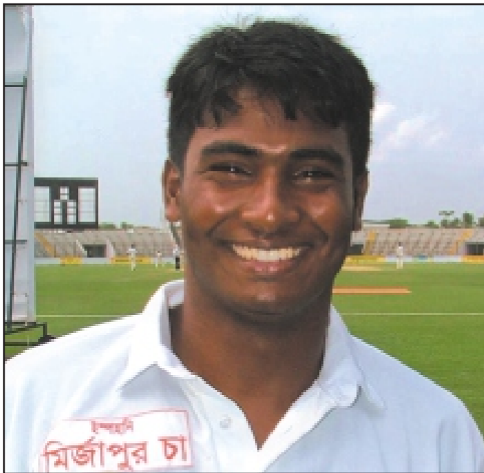
Record-breaking Wayaskarani ... 8 for 69