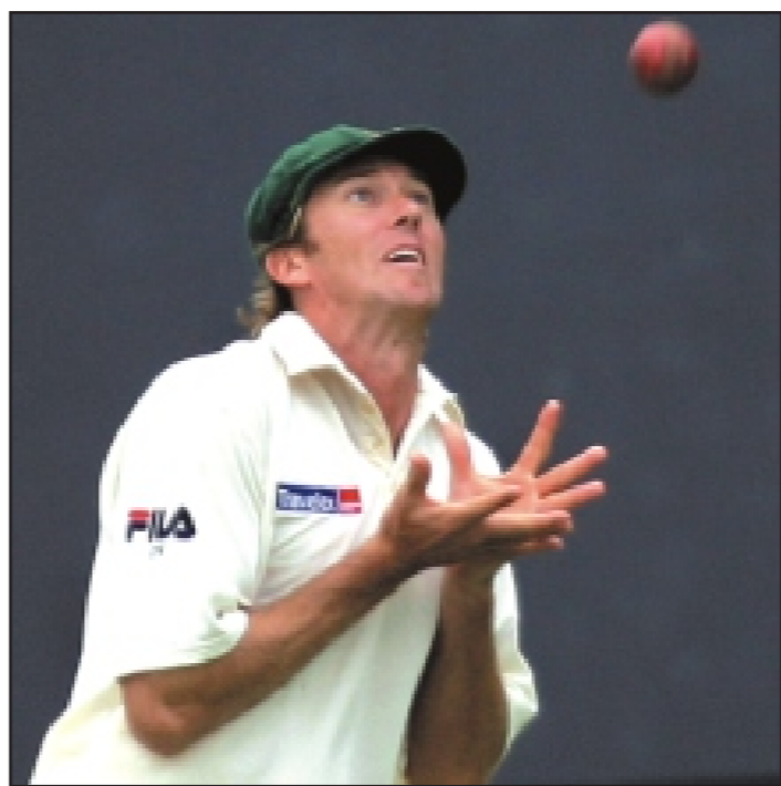
I WISH I DROPPED IT! Australia's Glenn McGrath is about to take the catch off Daniel Vettori of New Zealand on the fourth day of the third and final Test in Auckland yesterday.

"We have played some great cricket," he said.