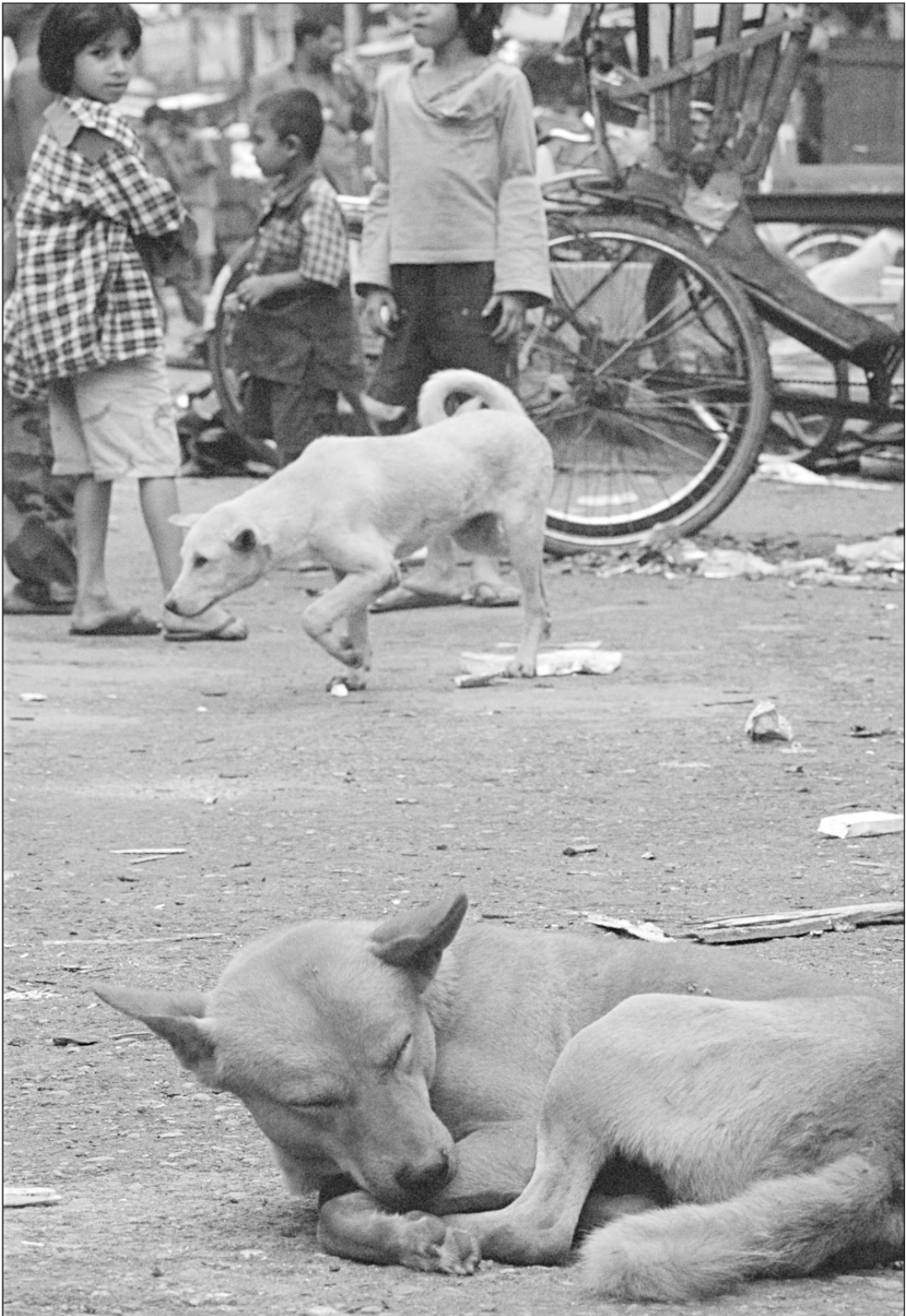
Stray dogs lie around posing health risk to city population.