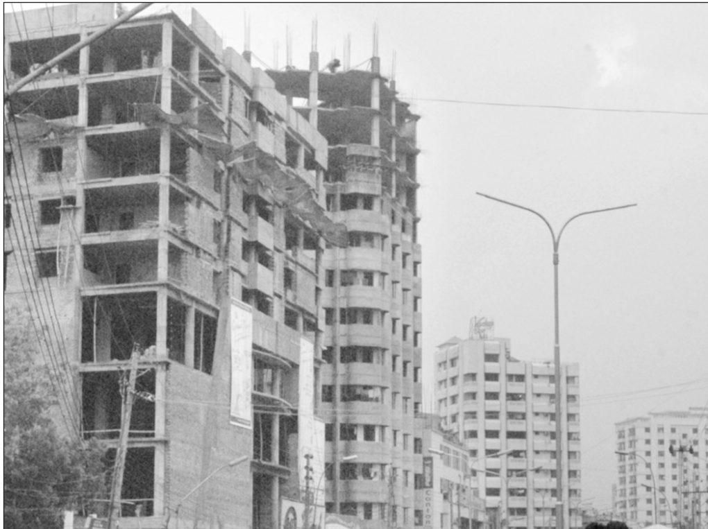
The city becoming a concrete jungle without any room or green for children.

air if houses are designed properly," said Rafiq Azam. He cited the example of a building located at Khajedewan in the old part of the city where 14 families have been accommodated. "It has enough air and sunlight coming in and it also has miniature gardens," he said.