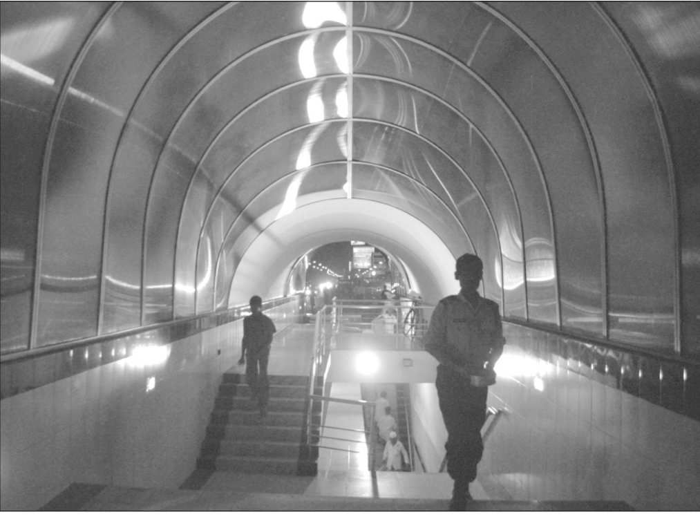
The recently renovated Karwan Bazar underpass is now in need of consistent maintenance.

after the electrification system of the underpass. When light bulbs go off, we replace them immediately. We also repair connections. On the otherhand, the DCC sweepers, who clean the adjacent roads in the morning every day, also clean the underpass," added Mannan.