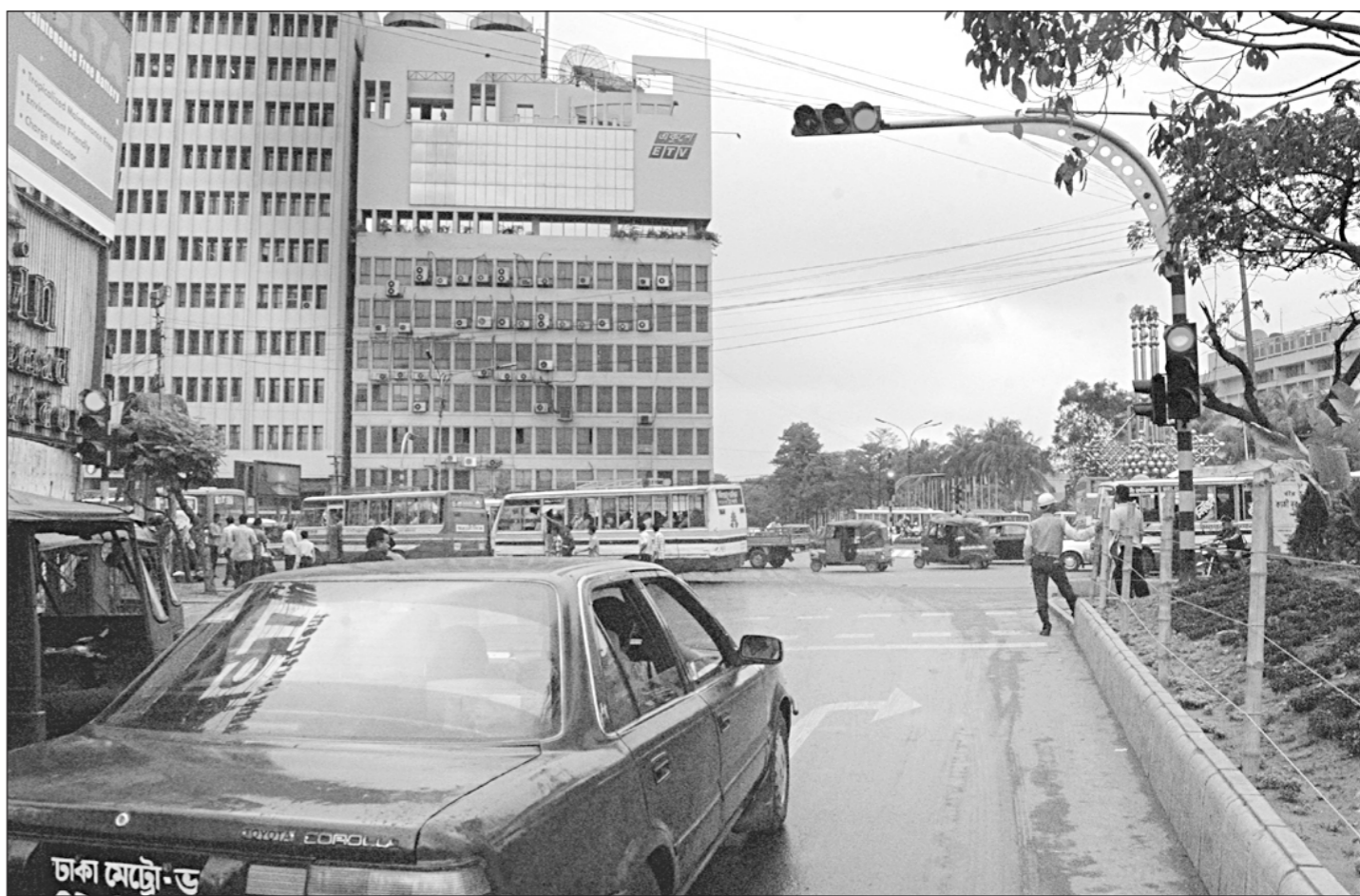
Electronic signals at Hotel Sonargaon intersection has eased the rush of traffic.

Lack of awareness of pedestrians also attribute to the problems near Shahbagh. Most signals for pedestrians are out of order and many people still do not know how to use the ones that are working. Therefore, people tend to cross the busy roads whenever they feel like by holding off traffic.