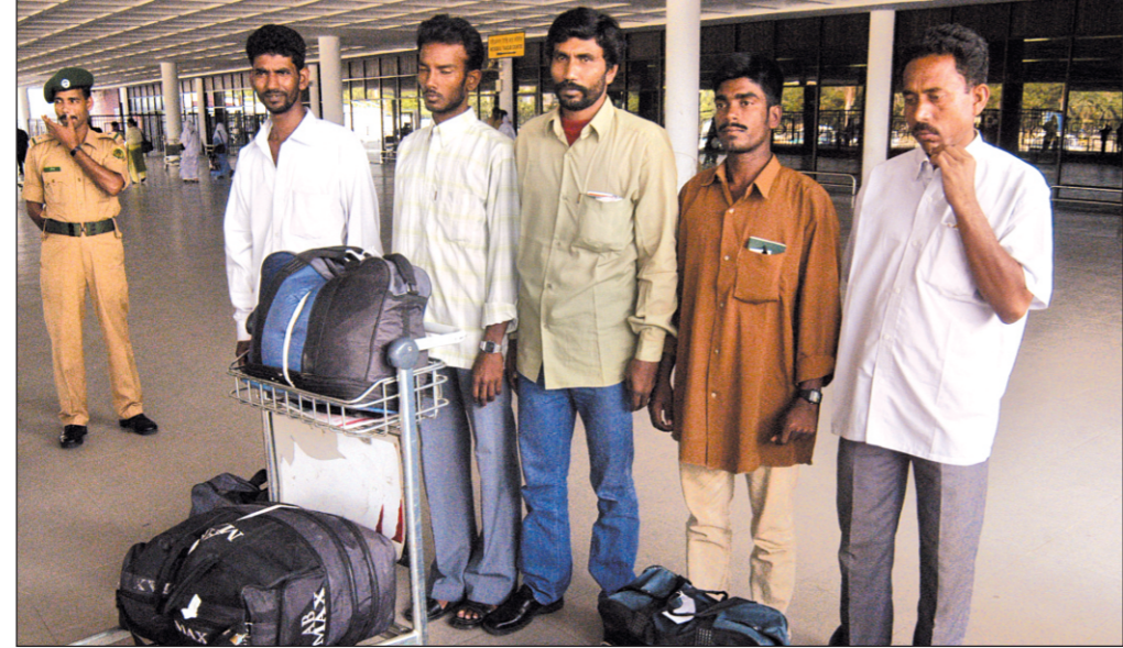
DEAD DREAMS: Five of the 12 men, who had gone to the Maldives for high-wage jobs, wait at Zia International Airport on their return home yesterday. Manpower touts often cheat prospective job seekers out of thousands promising them non-existent jobs abroad.

Six people were killed in three road accidents in Narsingdi, Comilla and Manikganj districts yesterday. Three people died on the spot when a wood-laden pick-up collided head-on with a truck on the Dhaka-Sylhet highway in Narsingdi district. The dead are Jamal, 30, Monsoor, 35, and Kamrul, 20. All of them hailed from Rupganj upazila under Narayanganj district. Pushcart drivers Rabiul, 28, and Ershad, 27, were killed as a speeding bus rammed their bamboo-laden carriage at Lalmai on the Comilla-Noakhali road early yesterday, police said. The bus sped away after the accident. SEE PAGE 15 COL 1