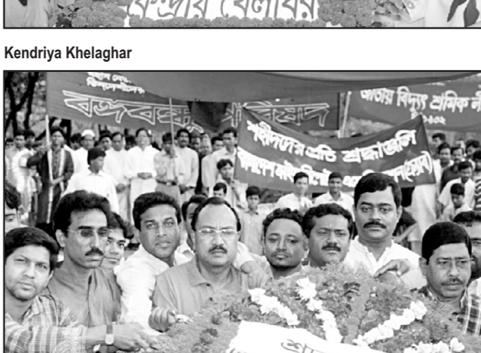
Dhaka Reporters' Unity