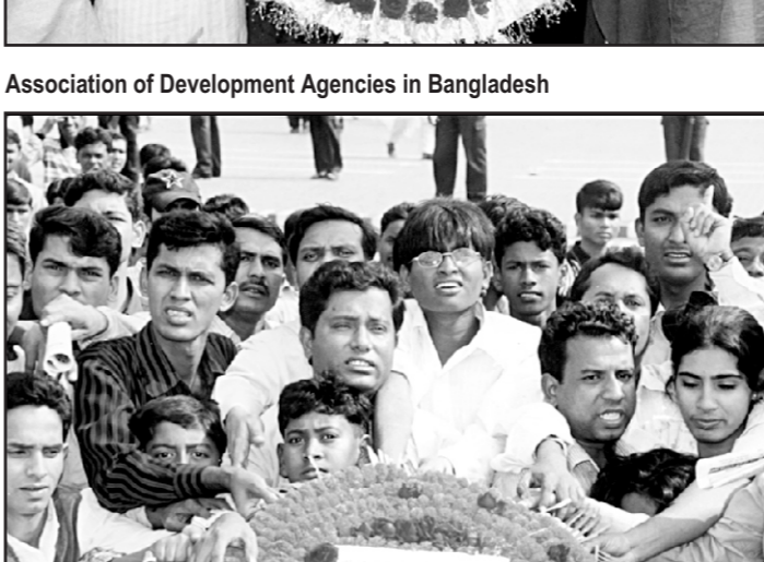
Amra Muktijuddhar Santan