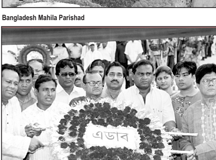
Association of Development Agencies in Bangladesh