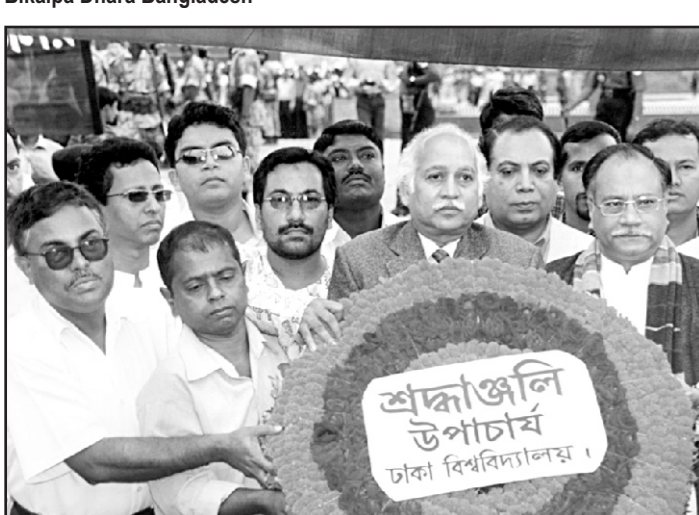
Dhaka University Vice-Chancellor