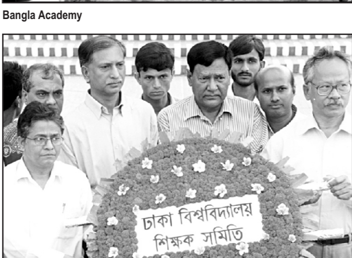
Dhaka University Teachers' Association