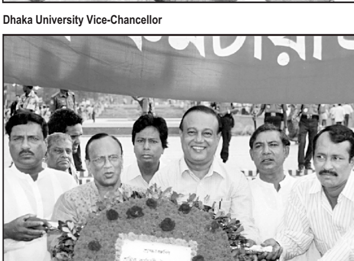
Sramik Karmachari Oikya Parishad