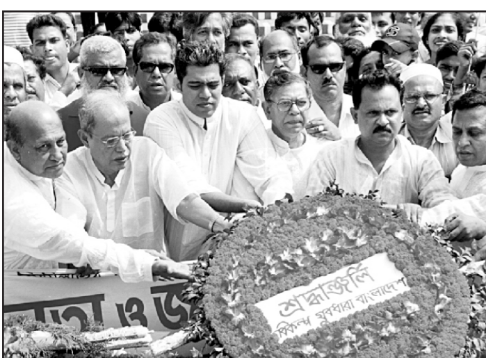
Bikalpa Dhara Bangladesh