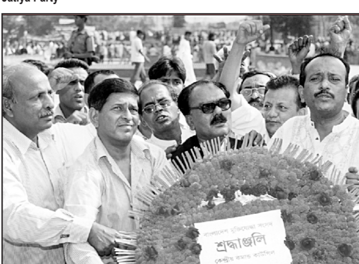
Bangladesh Muktijuddha Central Command Council