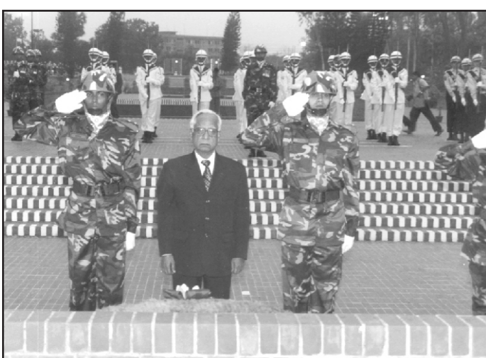
President Iajuddin Ahmed

He, however, assured that that the authorities would consider any proposal in this connection.