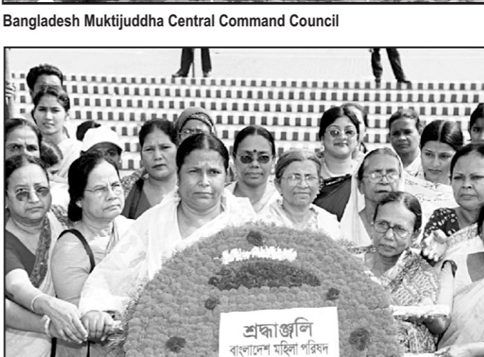
Bangladesh Mahila Parishad