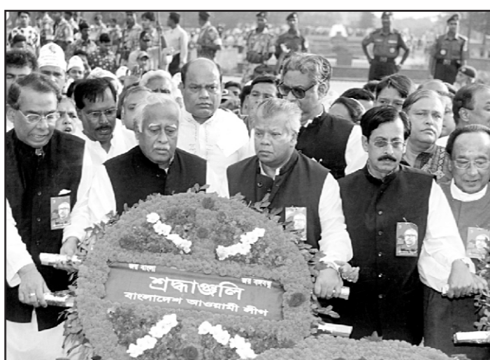
Bangladesh Awami League