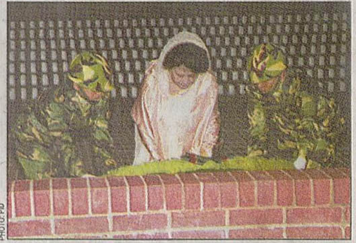
Prime Minister Khaleda Zia places a wreath at the National Memorial at Savar to pay homage yesterday to Independence War martyrs on the Independence and National Day.