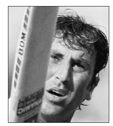
YOUNIS KHAN ...267

When he was appointed vicecaptain for the current India tour in