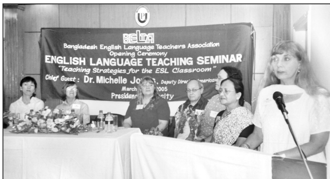
Bangladesh English Language Teachers' Association launches a five-day training programme for the ESL teachers at the Presidency University auditorium in the city yesterday.