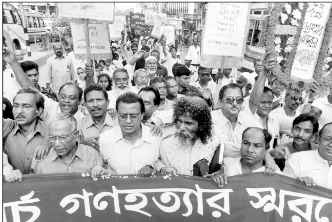
Muktiyoddha Gono Parishad took out a procession in the city yesterday demanding official observance of the dark night of March 25.