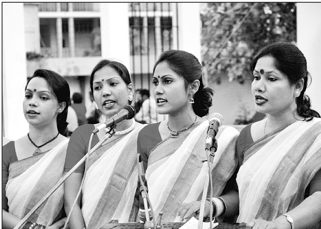
Artists render song at a function organised by Sannilita Sangskritik Jote at the Central Shaheed Minar in the city yesterday in celebration of the Independence Day.