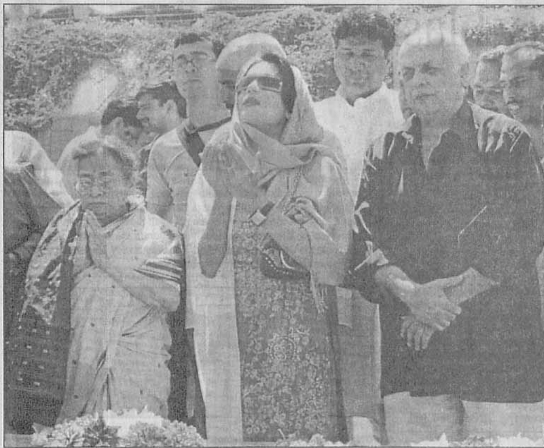
Pakistani actress Meera (C) offers prayers with Indian film maker Mahesh Bhatt (R) at the Mahatma Gandhi Samadhi (memorial) at Rajghat in New Delhi yesterday. Meera arrived Wednesday in India to take part in a joint Indian-Pakistani Peace March which was flagged off from New Delhi and is scheduled to end in Multan, Pakistan. The march is aimed at promoting peace between the two neighbours with a slogan of "Stop Funding Hate".