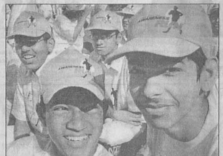
Indian school children take part in a tuberculosis awareness run on the occasion of the World Tuberculosis Day in New Delhi yesterday. The World Health Organisation (WHO) estimates that some 3.54 million Indians are infected by tuberculosis.

"The exception is Africa, where incidence has been rising more quickly in countries with higher HIV prevalence rates... But for the strongly adverse trends in Africa, prevalence and death rates would be falling more quickly worldwide."