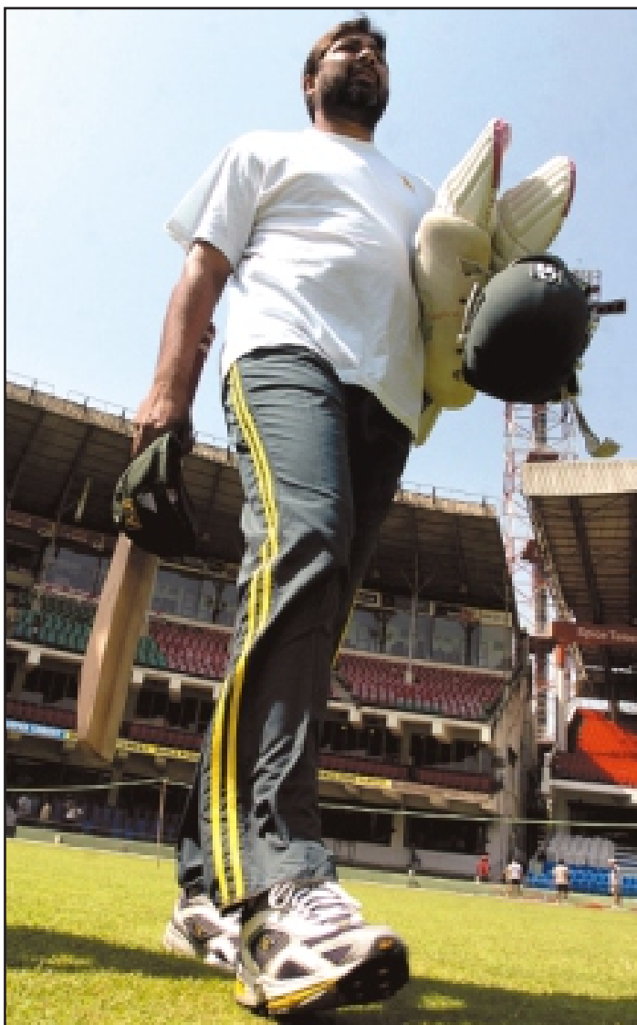
WILL HE STAND TALL HERE? Pakistan captain Inzamamul Haq walks into the Chinnaswamy Stadium in Bangalore for practice yesterday.