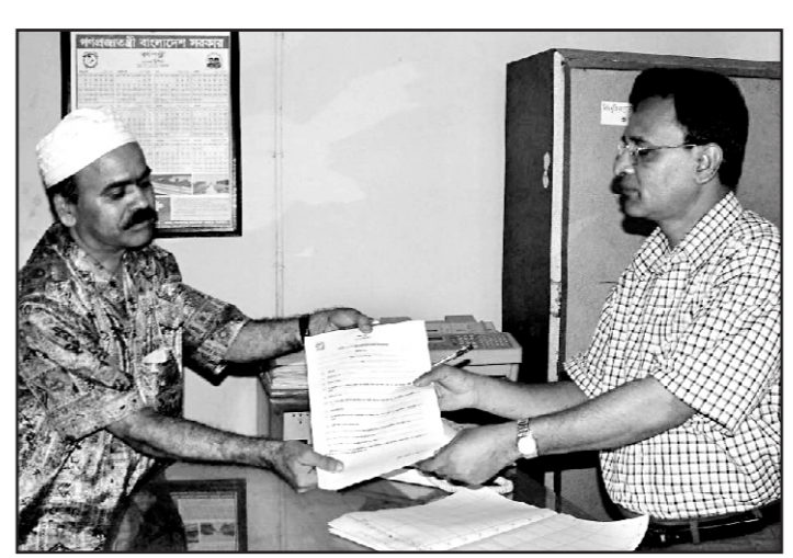
A candidate for the post of ward commissioner in the Chittagong City Corporation polls receives nomination paper from the district election officer in the port city yesterday.

On the occasion, Qurankhwani and doa mahfil will be held to pray for the eternal peace of the departed soul.