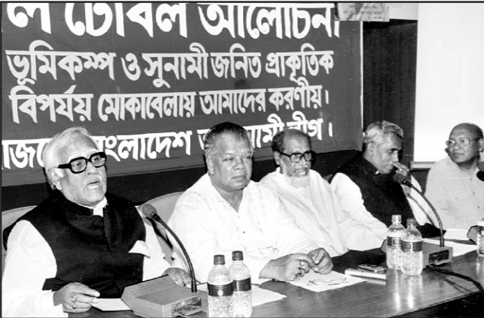
Awami League General Secretary Abdul Jalil speaks at a roundtable titled 'Our role in tackling natural disasters like earthquake and tsunami' organised by the AL at the National Press Club in the city yesterday.

UNB, Dhaka Awami League leaders at a roundtable in the city yesterday said excess lifting of groundwater and construction of high-rise buildings should be discouraged and tree plantation drive be geared up to prevent natural disasters like earthquake and tsunami.