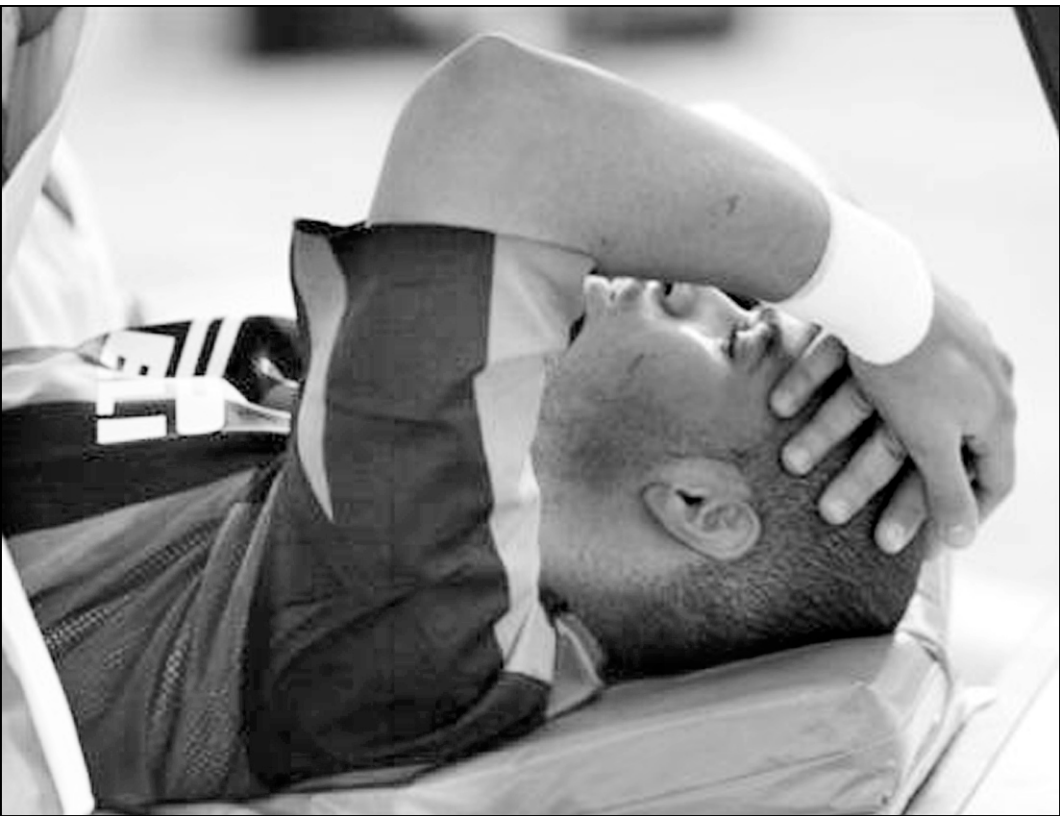
Inter Milan superstar Adriano holds his head as he is carried away on a stretcher after injuring his knee during the match against Fiorentina, at the San Siro stadium in Milan on March.