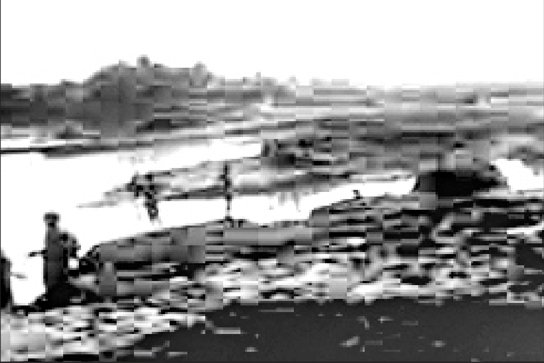
A portion of the breached Bhogai river embankment in Hatipagar(L) and land covered with thick sand layer.