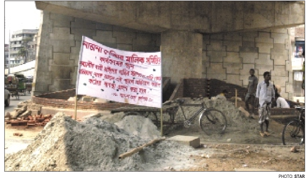
A transport owners' association has put up a banner arbitrarily designating the spot at Shahjahanpur under Khilgaon flyover for running their operations in a move to grab land.