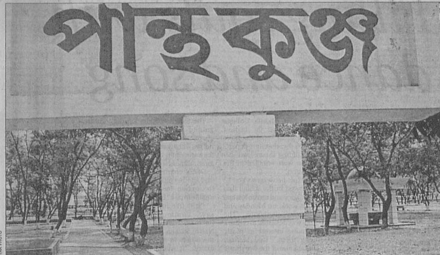
The Pantha Kunja park in the heart of the city beautified for the Saarc summit, still awaits opening to the public.

Besides caller ID would help subscribers to trace the unwanted callers and to report such calls to the BTTB or even to law enforcers, if necessary.