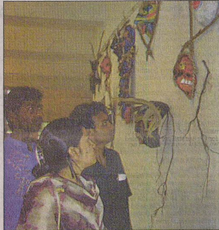
Visitors at the mask exhibition