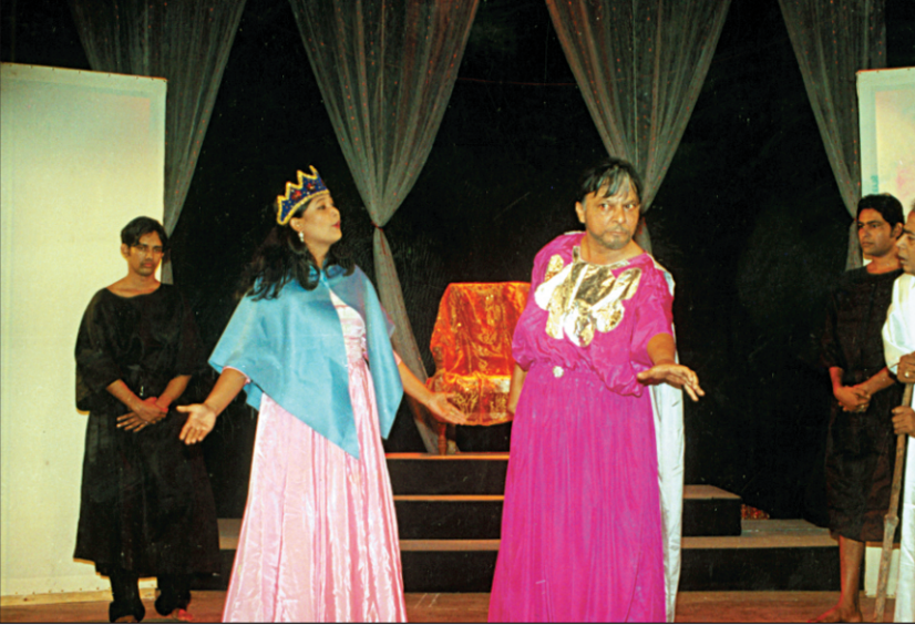
A scene from Nana Ranger Dinguli